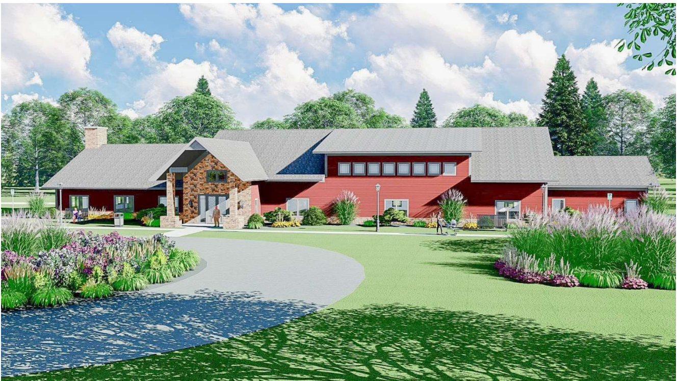
Artist rendition of the Community and Cultural Center and Library

In order to realize our goal of establishing a permanent location for the Smithfields, we invested $1,000,000 and several years of work. Funding came from grants, a commercial loan and EMPL reserve funds. The EMPL goal is to repay the loan as soon as possible to have funds available for other important initiatives.